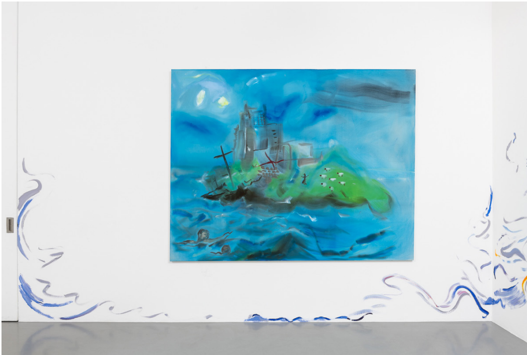
Sophie von Hellermann, Treasure Island , 2017, acrylic on canvas, 180 x 230 cm, 70 7/8 x 90 1/2 in

PV: THURSDAY, 15 FEBRUARY 2018 6PM – 8PM